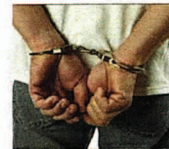
Character / Criminal